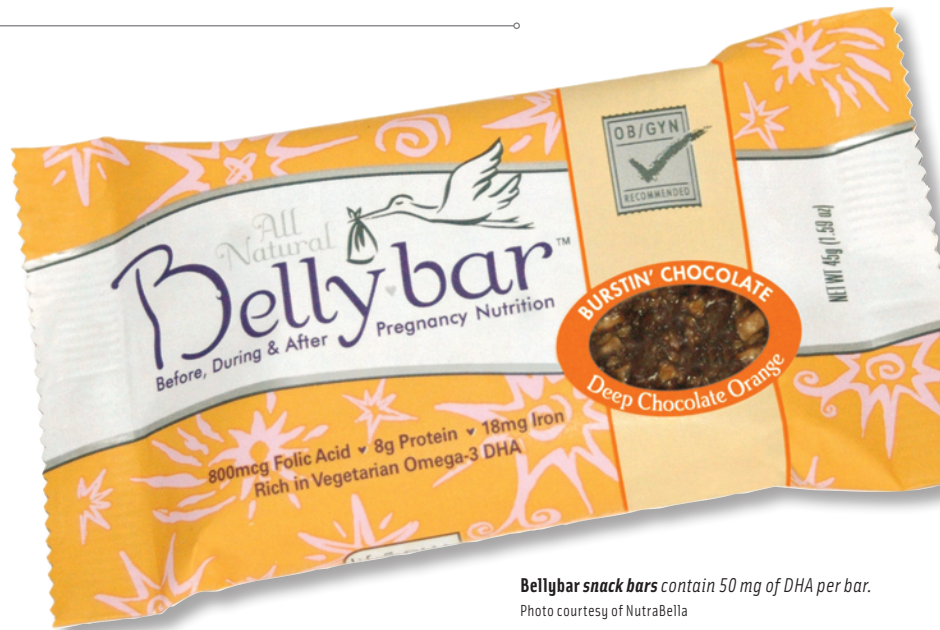
Bellybar snack bars contain 50 mg of DHA per bar.

The diversity in omega-3 fortified products can be attributed to the sophistication of ingredient offerings by omega-3 suppliers.